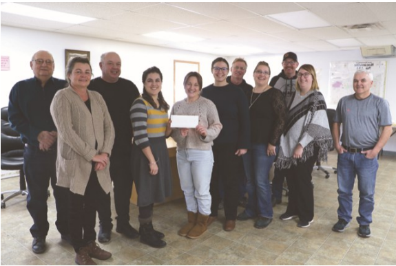
RM of Rocanville presents cheque to Rocanville Aquatic Centre.